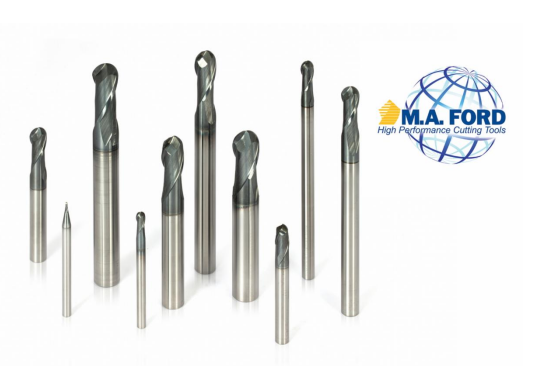
250 Series- 2 Flute Ball Nose End Mill