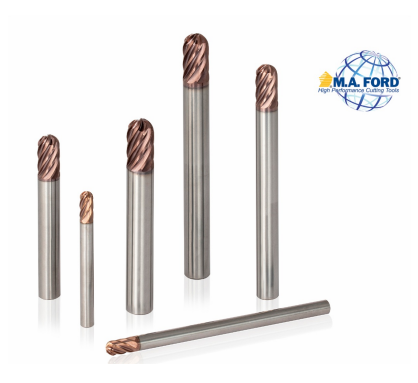
MFPB Series- Part of TuffCut®