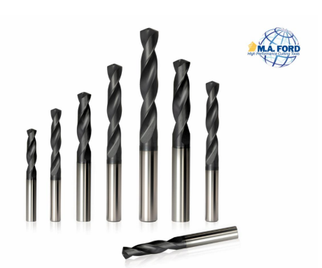
Twister® HPD Drill Series